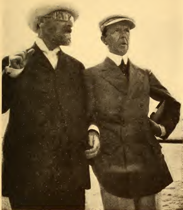
JOSEPH PULITZER AND ONE OF HIS SECRETARIES ON THE DECK OF THE "LIBERTY"